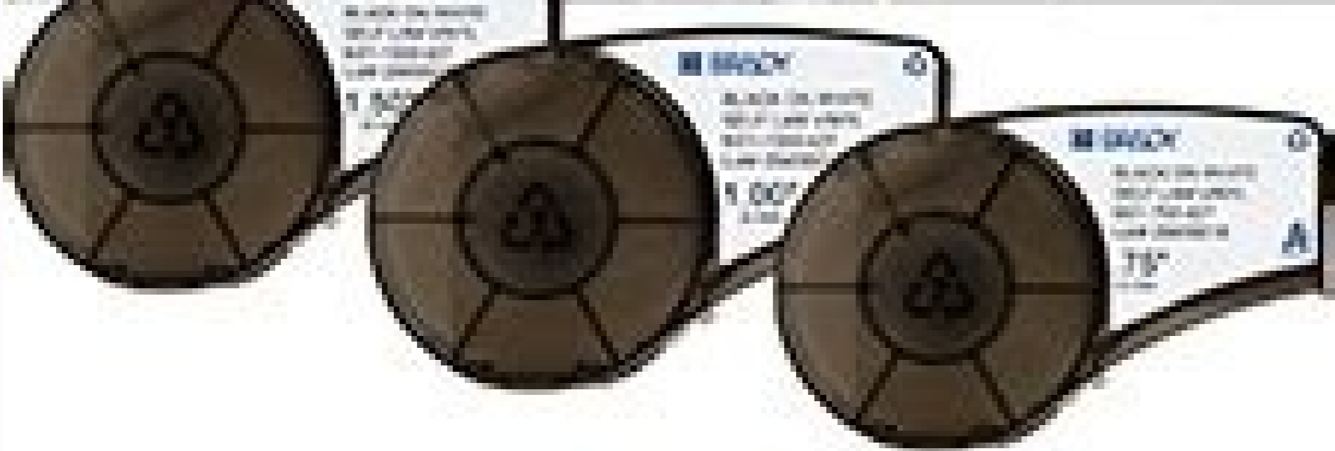
Brady label printer price. Brady label maker not printing.